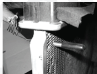
Then push the insulator cap over the end of the sensor.