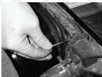
Insert the temp. sensor near the inlet hose...

5. If manual control is desired, use a manual switch. Refer to wiring diagram below.